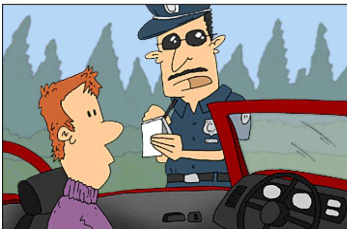
GOD GAVE YOU FREE WILL... THE CITY DID NOT